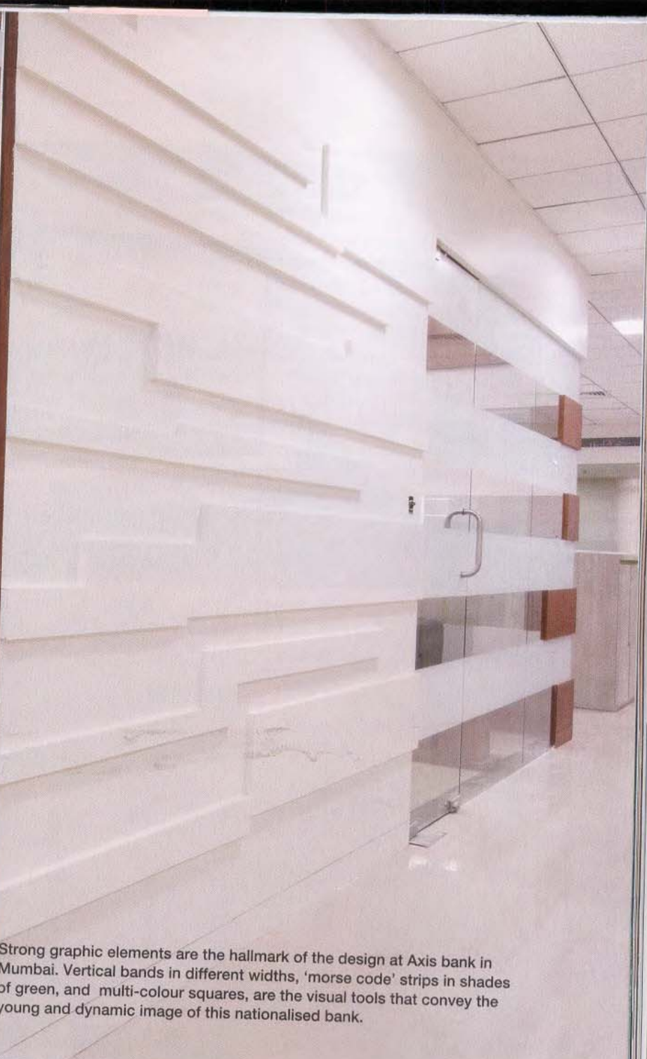
Strong graphic elements are the hallmark of the design at Axis bank in Mumbai. Vertical bands in different widths, 'morse code' strips in shades of green, and multi-colour squares, are the visual tools that convey the young and dynamic image of this nationalised bank.