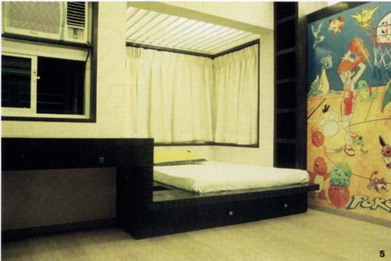
3 & 4. The water cascade which forms the visual focus. 5. Children's bedroom with the pokemon wall and built in furniture.