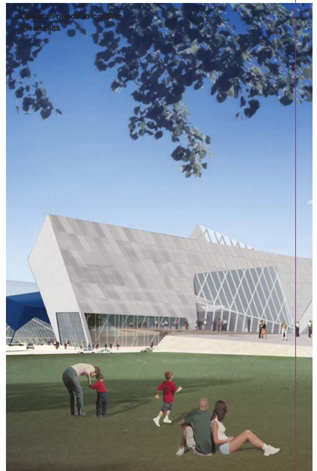
Decorah needs to combine these pics