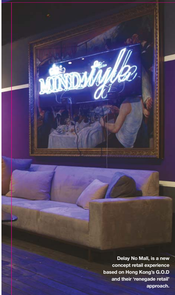
Delay No Mall, is a new concept retail experience based on Hong Kong's G.O.D and their 'renegade retail' approach.