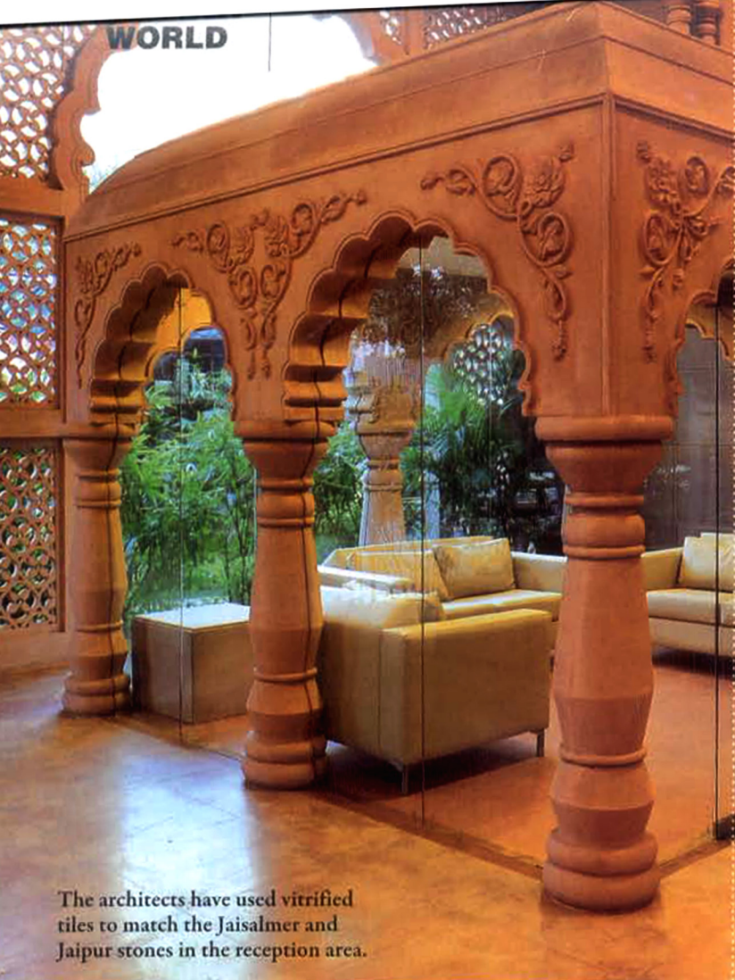
The architects have used vitrified tiles to match the Jaisalmer and Jaipur stones in the reception area.