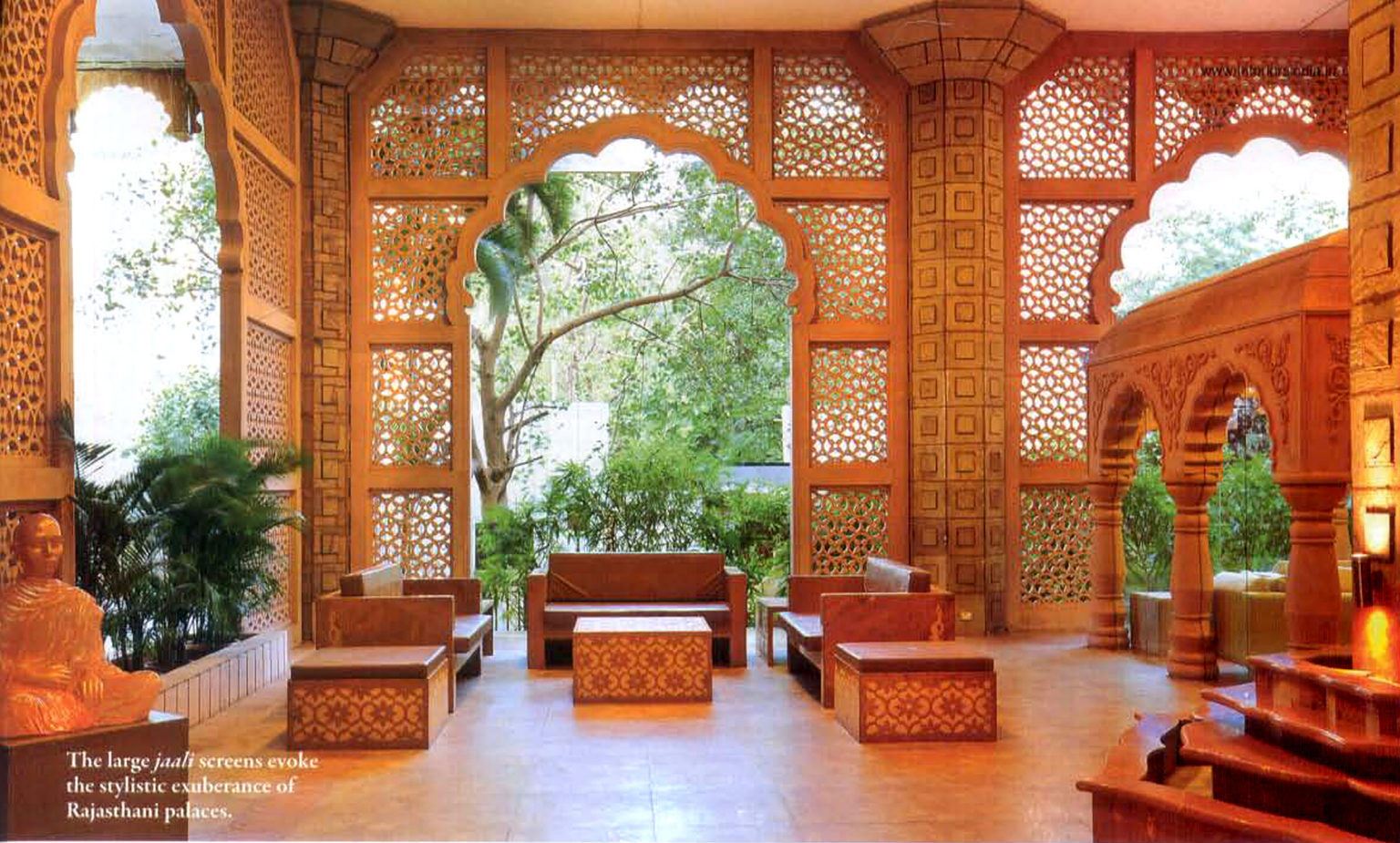
The large jaali screens evoke the stylistic exuberance of Rajasthani palaces.

the concrete and finally installing them on site. “GRC could be moulded and etched upon; it was also strong enough to hold the weight of the 20-foot jaali screens,” explains Santha. Jaipur and Jaisalmer stone were used along with matching vitrified tiles for the floor.